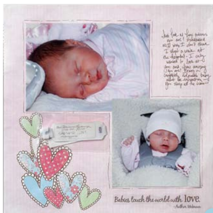
The medium Memorabilia Pocket added here features baby's hospital ID bracelet.