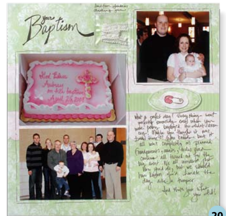
The small Memorabilia Pocket added here features lace from the baby's christening gown.