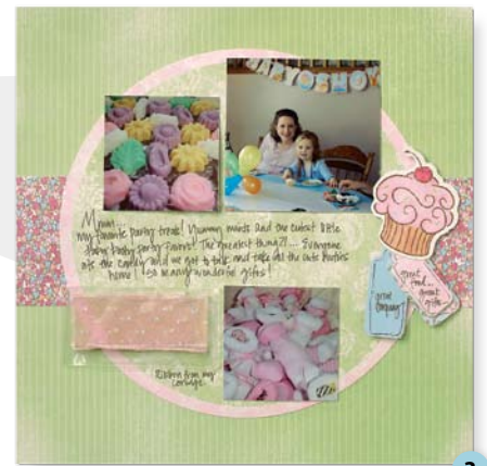
The medium Memorabilia Pocket added here features the ribbon from mother's corsage.