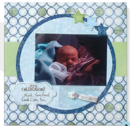
The medium Memorabilia Pocket added here features baby's hospital ID bracelet.