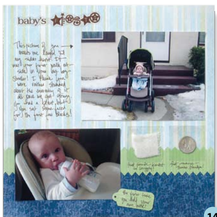
The two small Memorabilia Pockets added here feature a piece of baby's favorite blanket and a special coin.