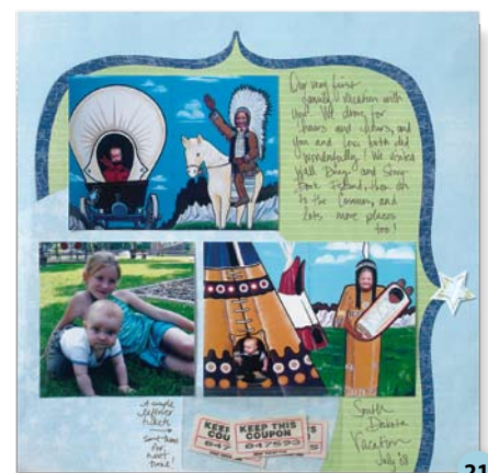
The medium Memorabilia Pocket added here features tickets from baby's first vacation.